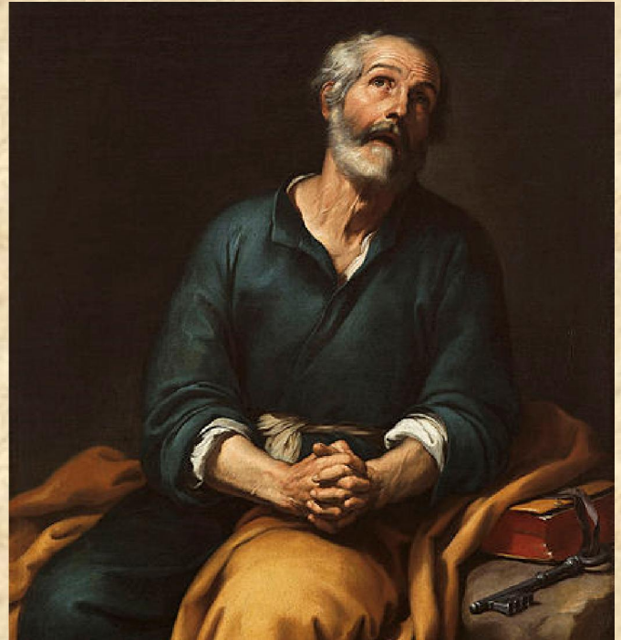
SAINT PETER, BARTOLOMÉ MURILLO (1617-1682)

TO MINISTER TO THE NEEDS OF THE COMMUNITY, TO BE FAITHFUL STEWARDS OF GOD'S CREATION - AWAKENING FAITH AMONG THE HOPELESS, AND PROMOTING LIFE EVEN WITHIN THE CULTURE OF DEATH.