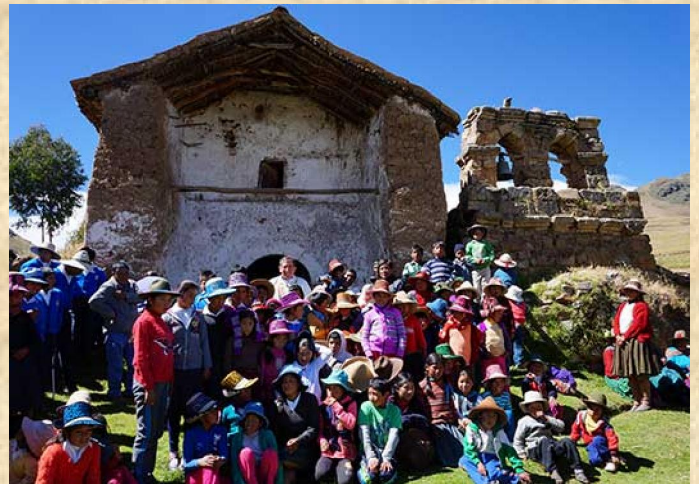
SCENE FROM THE PRELATURE OF SICUANI

Expectant parents and their families are encouraged to seek the Lord's blessings and the intercession of the Blessed Virgin Mary.