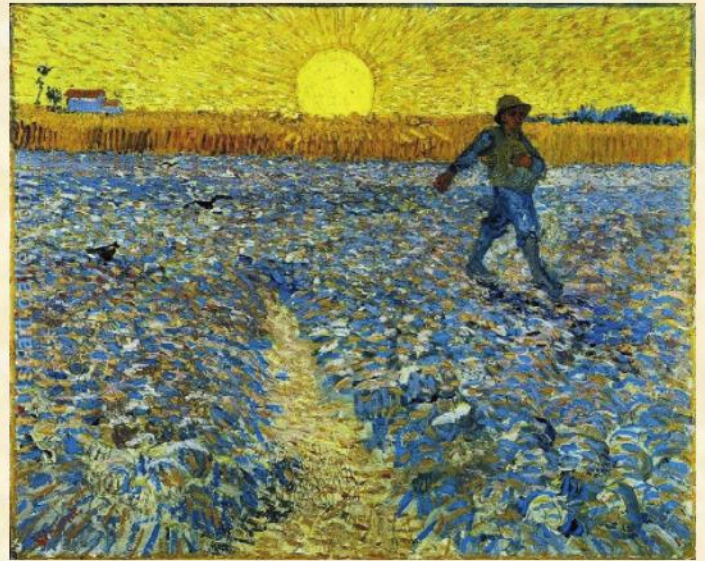
THE SOWER, VINCENT VAN GOGH, 1888